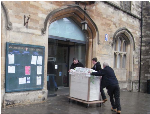
The display case arriving at the Museum

No charge and free glass of wine. This is for rings and other finds we have acquired in recent years